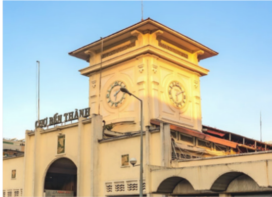
Ben Thanh Market