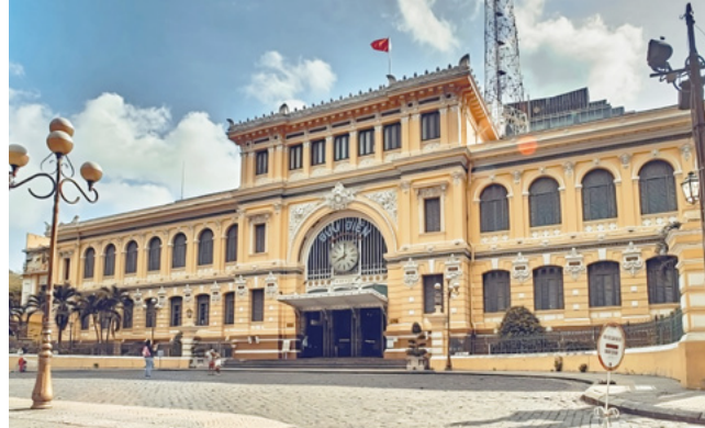
Saigon Central Post Office