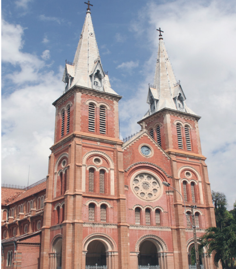
Notre-Dame Cathedral Basilica of Saigon

Ho Chi Minh City is considered as the prosperous economic center in Vietnam. The cross-culture leads to a unique attraction for this magnificent city. With a lot of modern architecture, it is evident in the frantic way of life, the advanced high-rise buildings, and the varied cuisine.