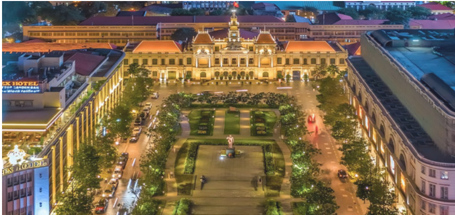
Nguyen Hue Walking Street